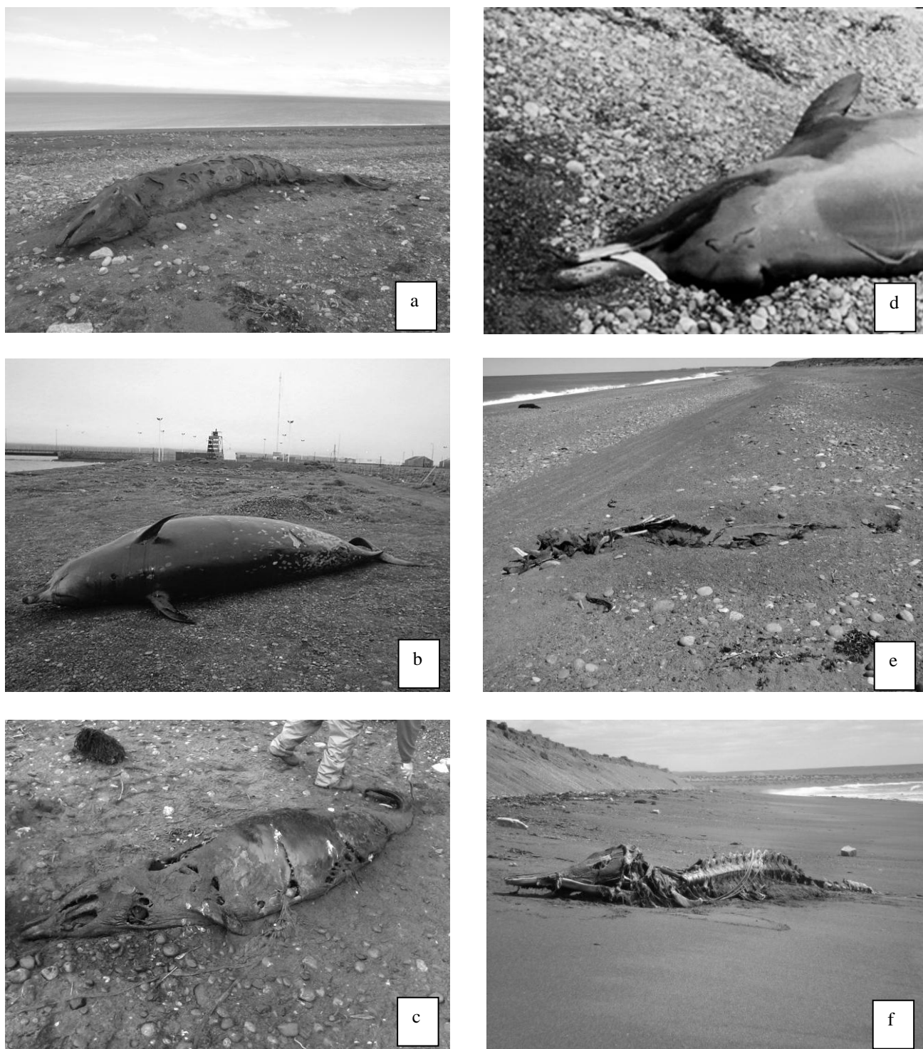
Figure 2. Specimen found stranded on Santa Cruz province between 1998 and 2011. a: FCCVZC200210; b: FCPLZC100505; c: FCCVZC100411; d: FCSCML120298; e: FCSJML250107; f: FCBMTS080208.