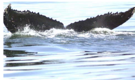
Madagascar 2001 (TF-MAD-182)