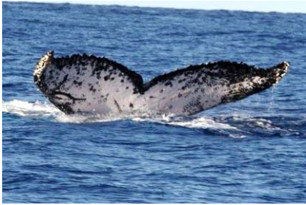
Reunion 2008 (TF-REU-08-172)