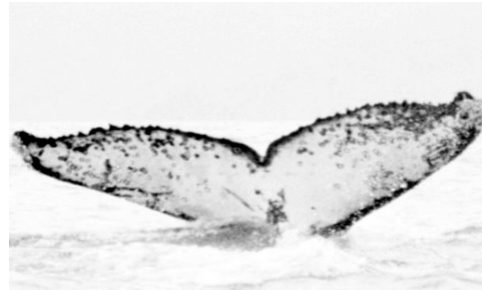
Madagascar 2000 (TF-MAD-007)