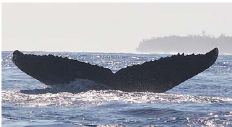
Reunion 2008 (TF-REU-08-181)