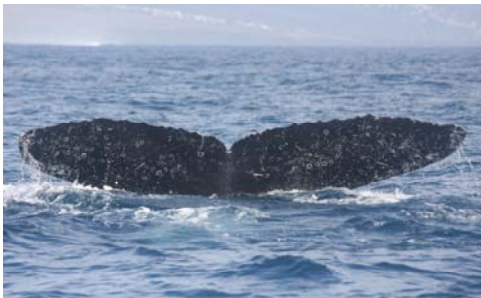
Reunion 2010 (TF-REU-08-181)