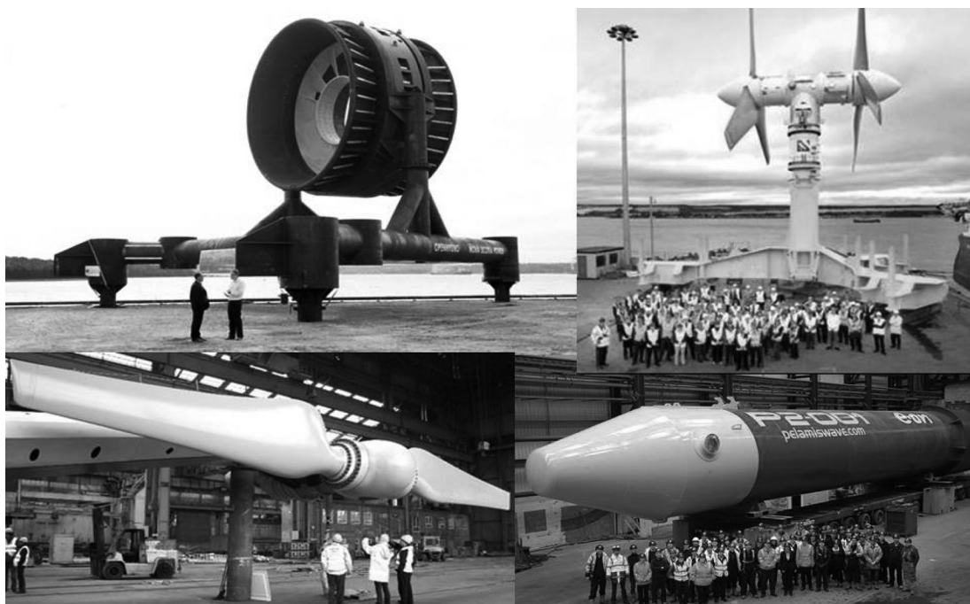
Fig. 1. Examples of three leading tidal-stream turbines and one wave device. People in the pictures provide scale. Top left: OpenHydro ( http://www.openhydro.com ), top right: Atlantis AK-1000 ( http://www.atlantisresourcescorporation.com ), bottom left: MCT SeaGen ( http://www.seageneration.co.uk ), bottom right: Pelamis Wave Power ( http://www.pelamiswave.com ).

According to the German legislation a permit for offshore installations, such as wind farms, has to be granted unless it is demonstrated to, among other things, pose a threat to the marine environment. In order to provide the necessary information the applicant must compile an environmental impact assessment (EIA) based on data gathered during a comprehensive two-year research program (see http://www.bsh.de/en/Products/Books/Standard/7003eng.pdf ).